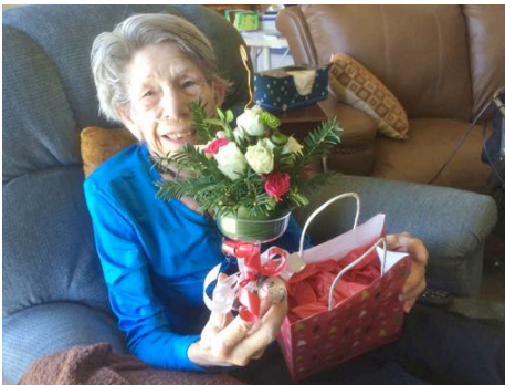
A Happy Recipient!