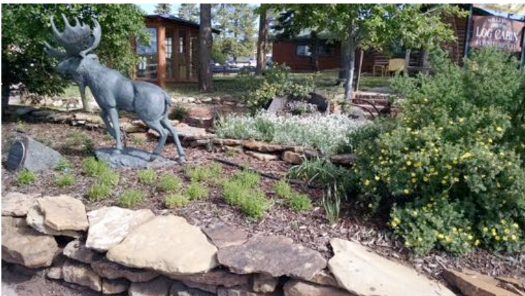
HWY 24, Woodlawn Park garden bed adopted by Gardeners with Altitude.