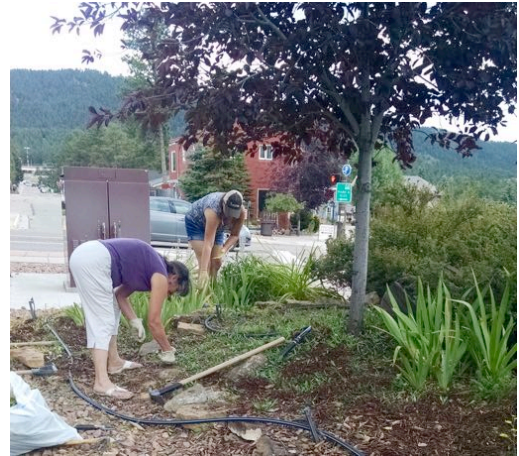
Volunteers weed, plant and mulch the garden.

The Gardeners With Altitude Garden Club is a small mountain club located in Woodland Park and draws members from Teller and Park Counties. The average elevation of members' gardens is over 8400' that presents unique challenges along with the usual wildlife and weather of Colorado. The club has adopted a large garden bed in downtown Woodland Park located on busy Highway 24. After three years of hard work, members have brought a semblance of order to the overgrown plant material by weeding, planting and mulching. Several members volunteered to help a local floral designer decorate a home for the very successful Holiday Home Tour. A rather informal group, the out and about meetings this year have included visits to a growing tunnel, a Thymekeepers greenhouse to learn about growing herbs and a floral shop for design. Meetings are held the 2 nd Saturday morning of the month or somewhere there about.